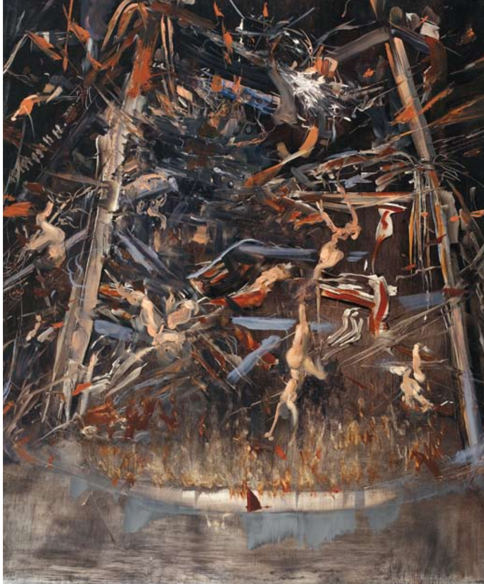
Facing page: 2L . 2010. Mixed media on paper. 57.2 x 76.2 cm.