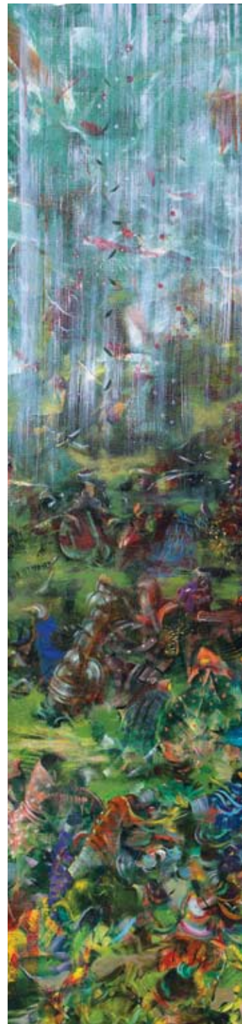
Right: It Happened and It Never Did . 2011. Oil on linen. Diptych. 182.9 x 274.3 cm in total.